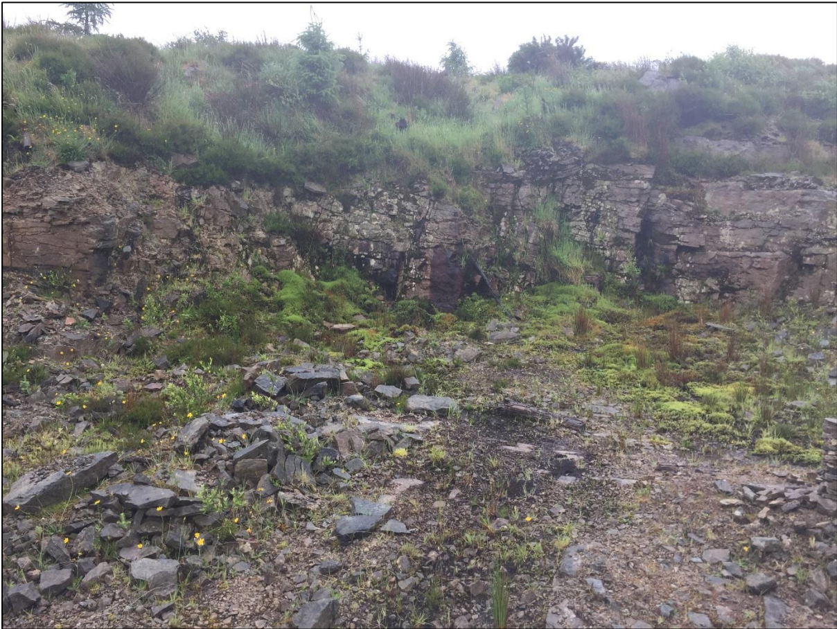
Plate 9-1: Bedrock exposure at disused borrow pit.

A regional northeast – southwest trending fault is mapped to intercept the eastern section of the site. A bedrock geology map for the proposed development site and grid route is included as Figure 9.14. The bedrock presented in Figure 9.14 shows the work areas along the turbine delivery route. While the proposed development site is predominantly underlain by sandstone, the works area in the forestry at Coolready is underlain by limestone.